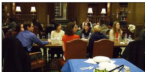
Students attended the Build Your Own Box event,

SLAPSG also has some interesting events in the works for the spring semester. We are trying to coordinate a trip to tour the "Mines" in conjunction with SAASC. We are also planning a resume and portfolio workshop. Finally, several members have expressed serious interest in going to the SLA Annual Conference in San Diego in June. We also have ongoing participation as a group with both Operation Medical Libraries and the Millvale Community Library.