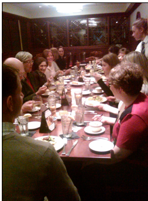
Holiday lunch table