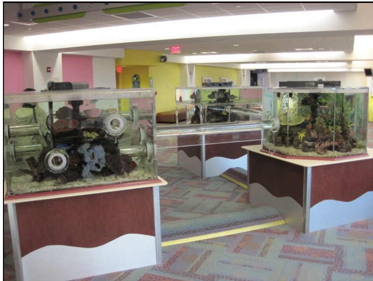
Fish tanks at CHP.