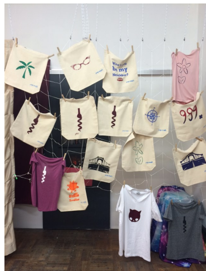
More products of the SLA Pittsburgh's Pop Craft event on March 23.