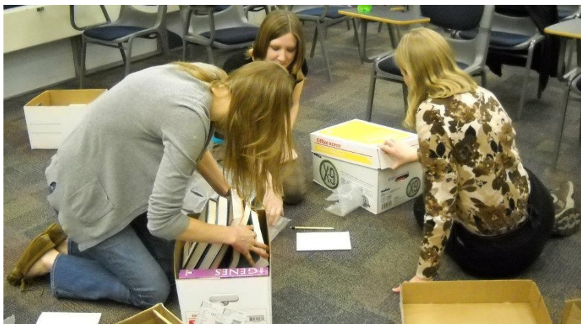
SLAPSG members pack medical texts for OML.