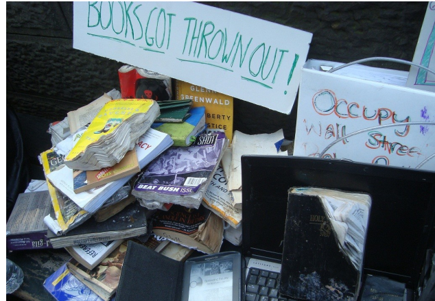
Books from the People's Library thrown out after raid.

Located in the northeast corner of the park, the