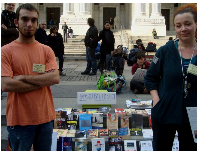
The People's Library after the raid.