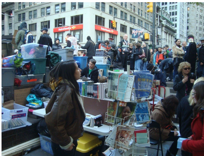
The People's Library at OWS.

suing the City of New York for the destruction of the Library.