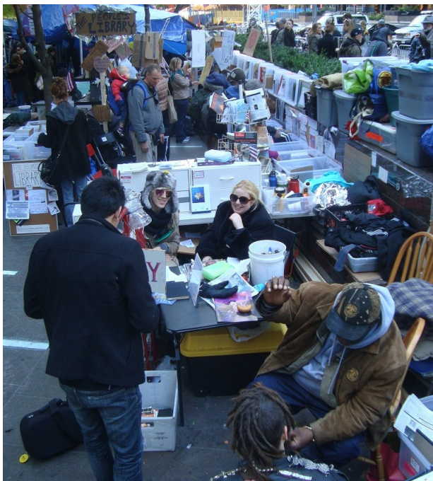
Corner of the People's Library.