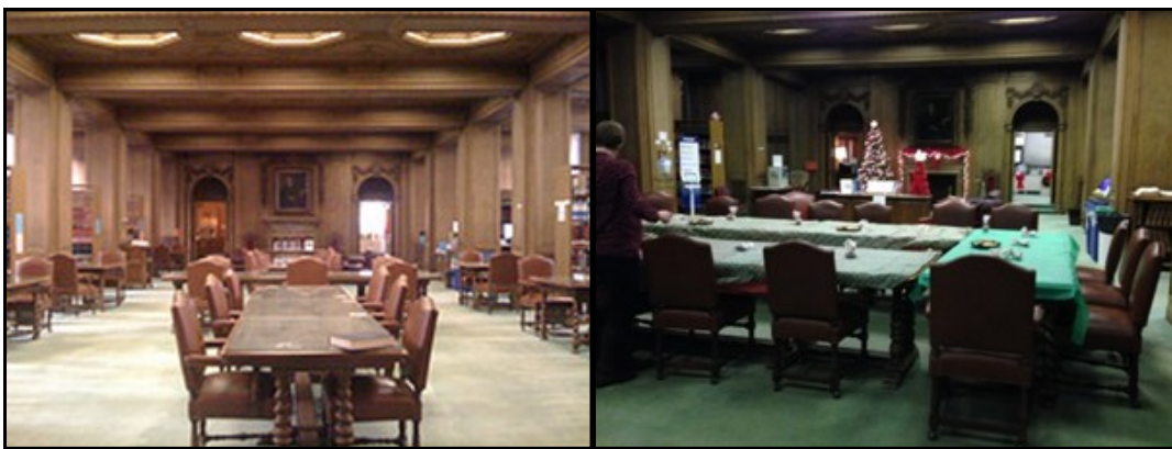
Before and after shot of the venue decorated for the event.