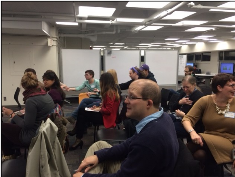
A great turnout of students and members for the event.