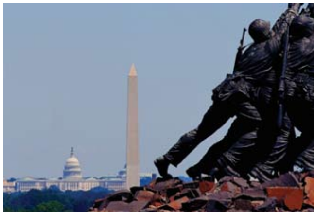
The Marine Corps War Memorial, also known as the Iwo Jima Memorial, is in nearby Arlington, Virginia, and offers a commanding view of the Washington Monument and U.S. Capitol

Information professionals representing the pharmaceutical and medical device industries will share their perspectives on working in a highly regulated, secretive and secure environment. They will discuss the challenges faced by corporate medical librarians, as well as their roles, responsibilities, and the resources they use. In addition to clarifying the difference between a medical librarian, a corporate medical librarian, and a STM librarian, they'll compare the roles and responsibilities of the info pro in the pharma and device industry.