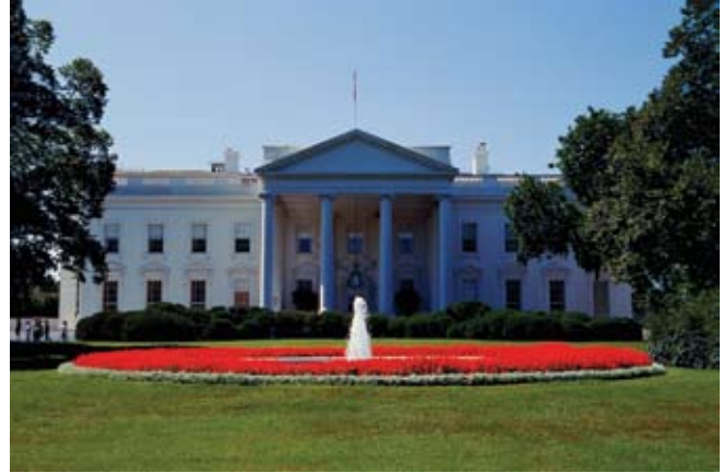
The White House, at 1600 Pennsylvania Avenue, N.W.