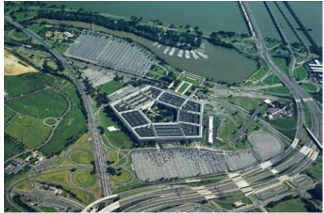
The Pentagon, completed in 1943, is still the world's largest office building.

Thanks to FOI Services, Inc., for sponsoring this session.