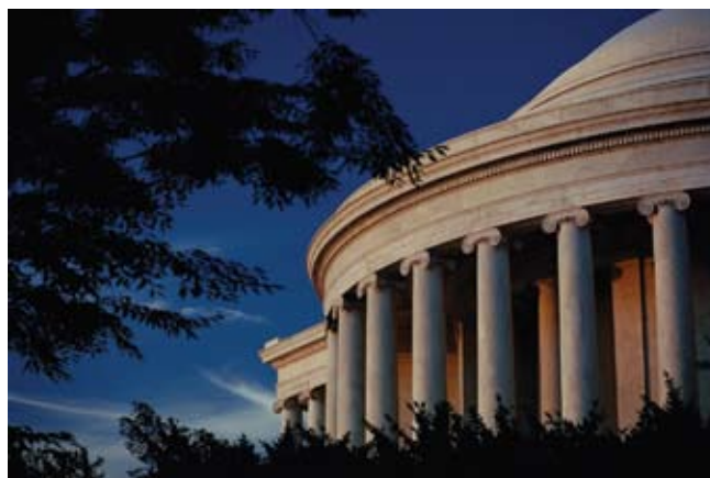
The magnificent Jefferson Memorial is sited on the banks of the Tidal Basin, where one can rent paddle boats.

Join us for a day in Annapolis, including a guided tour of the beautiful Naval Academy and the colonial area. Enjoy lunch on your own while taking in some shopping or relax with afternoon coffee in an outdoor cafe. Round trip transportation is included, lunch is additional.