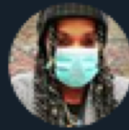
Summer Lee ✓ @SummerForPA