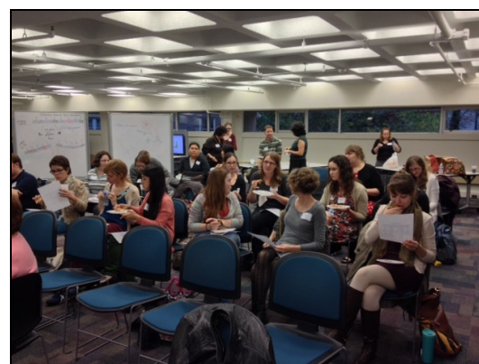
The event at Pitt's iSchool was well attended by students.